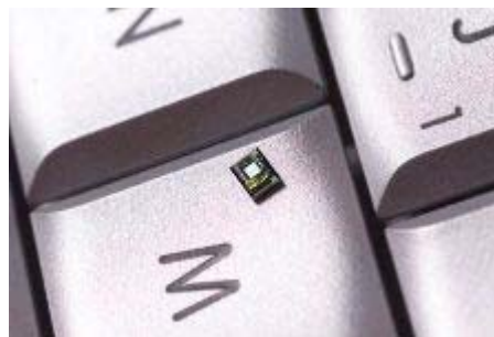
AKU2000 Digital MEMS Microphone - bare die on PC keyboard

More detailed information on how to design an embedded digital microphone array can be found in a new Akustica White Paper. This white paper provides guidelines for the mechanical, electrical, and acoustical design of the array.